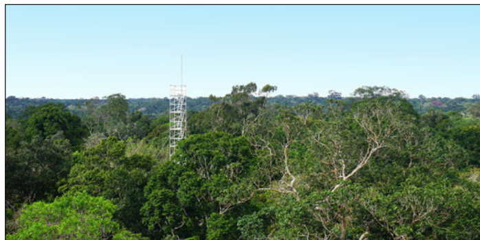
NGEE–Tropics. The future of tropical rainforests such as the Amazon (pictured, with flux measurement tower protruding from tree canopy) is the focus of a new research project that combines field experiments and predictive modeling.

The NGEE approach seeks to improve the representation of critical ecosystem processes in Earth system models (ESMs) by focusing on systems that are globally important, climatically sensitive, and understudied or inadequately represented in ESMs. In this approach, modeling and process research are closely and iteratively connected so that model structures and requirements are considered in the development of process studies whose outcomes in turn are designed to directly inform, challenge, and improve models. Ultimately, the NGEE–Tropics project will develop a representative, process-rich tropical forest ecosystem model, extending from the bedrock to the vegetative canopy-atmosphere interface. In this comprehensive approach, the evolution and feedbacks of tropical ecosystems in a changing climate can be modeled at the scale of a high-resolution ESM grid cell (e.g., less than 10-km resolution). NGEE–Tropics builds on another initiative under way in the Arctic (NGEE–Arctic), which is examining similar uncertainties facing Arctic ecosystems.