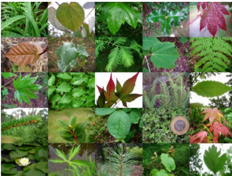
Figure 1. Variation in leaf size, shape, thickness and other properties.

Plant traits have long occupied a central role in ideas about plant physiological functioning. The large functional diversity of plants (Figure 1) is evident in looking across the world's ecosystems, which can be traced to the set of traits that govern this diversity. In particular, leaf traits such as its thickness, as expressed by the metric Leaf Mass per unit Area (LMA), or its reciprocal Specific Leaf Area (SLA), have long been a focus of studies on plant productivity (e.g. Blackman et al., 1919, West et al., 1920). Such traits govern a wide variety of plant process rates, and vary continuously across the enormous range of environments on Earth (Reich et al., 1997). Modern efforts to synthesize information on plant traits have led to the creation of large databases, such as TRY (Kattge et al., 2011), with which the relationships among plant traits, and between plant traits and the abiotic environment, may be identified. Such analyses led to