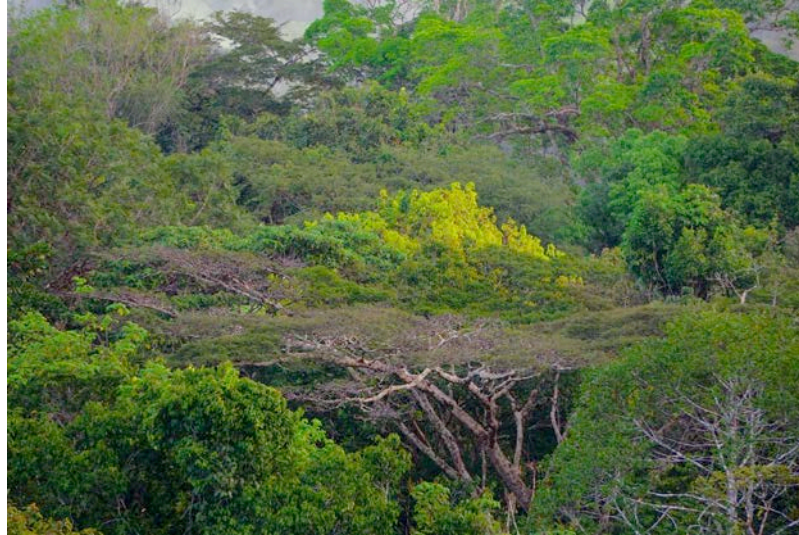
Figure 4. Tropical forest canopy near Manaus, Brazil.

and biomass (Malhi et al., 2004); these relationships may also be observed in the temporal response to global change (Brienen et al., 2015). Thus the current models, by focusing on the productivity response, may be effectively missing compensatory responses that will dampen